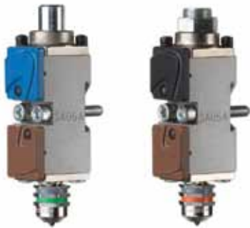
Color-coded plastic module covers provide easy identification of AO/AC (blue) or AO/SC (black) characteristics; brown color indicates needle/seal design.