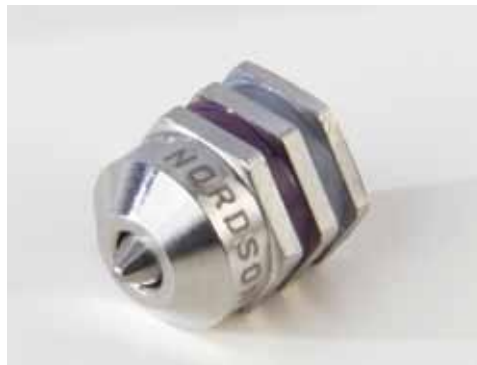
Removable, reduced cavity nozzle allows fast bead size changes without removing the module